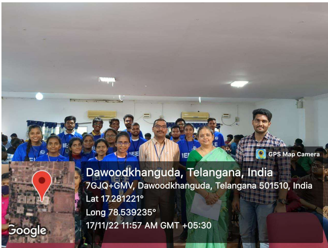
Faculty coordinators, PES ExCom of IEEE MVSR and Volunteers